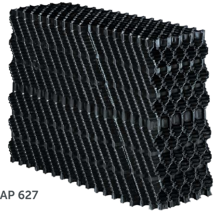
2H BIOdek® FAP 627

Maximum tolerances: On all dimensions +/- 20 mm or 2 %, whichever is the greater. Tighter tolerances and dimensions by prior agreement.